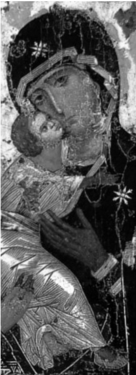
Virgin of Vladimir